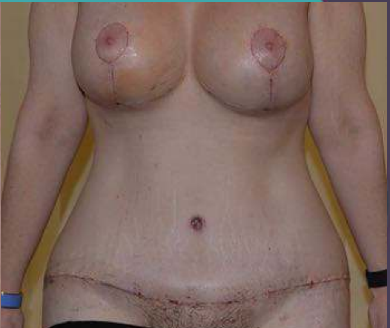
Healthy scars at three weeks