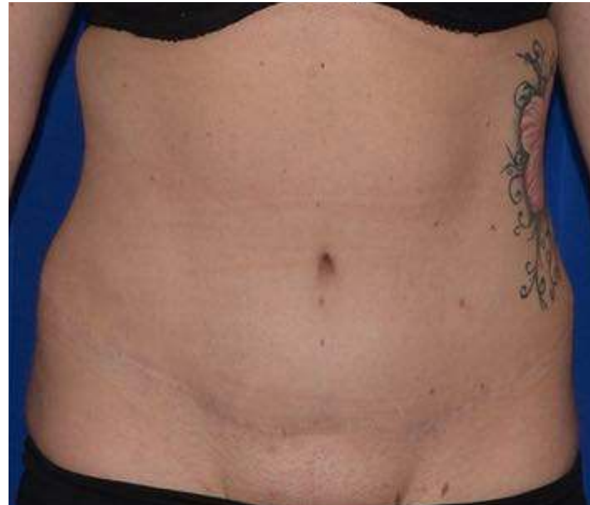
Appearance of the surgical tape two weeks after tummy tuck The scar 18 months later