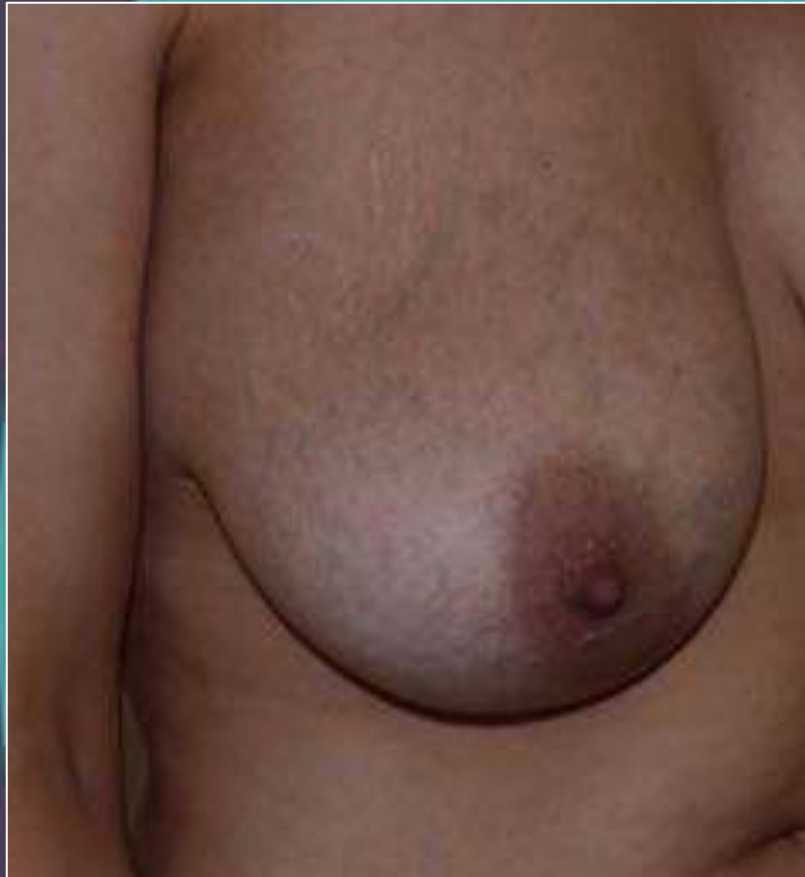
Before breast lift