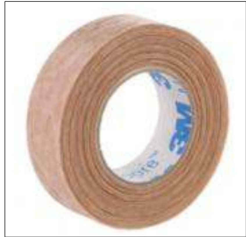
3M Micropore Skin Tone Surgical Tape