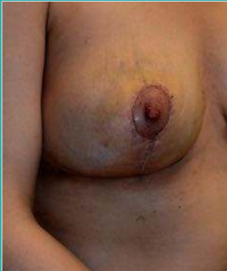
Two weeks after