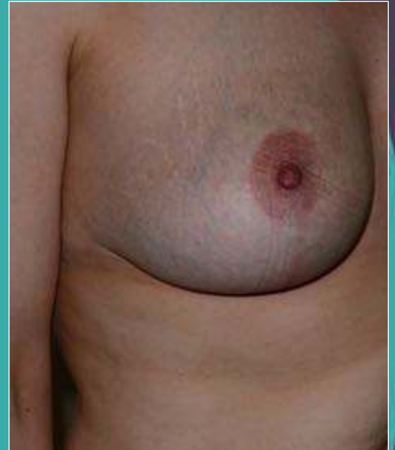
12 months after